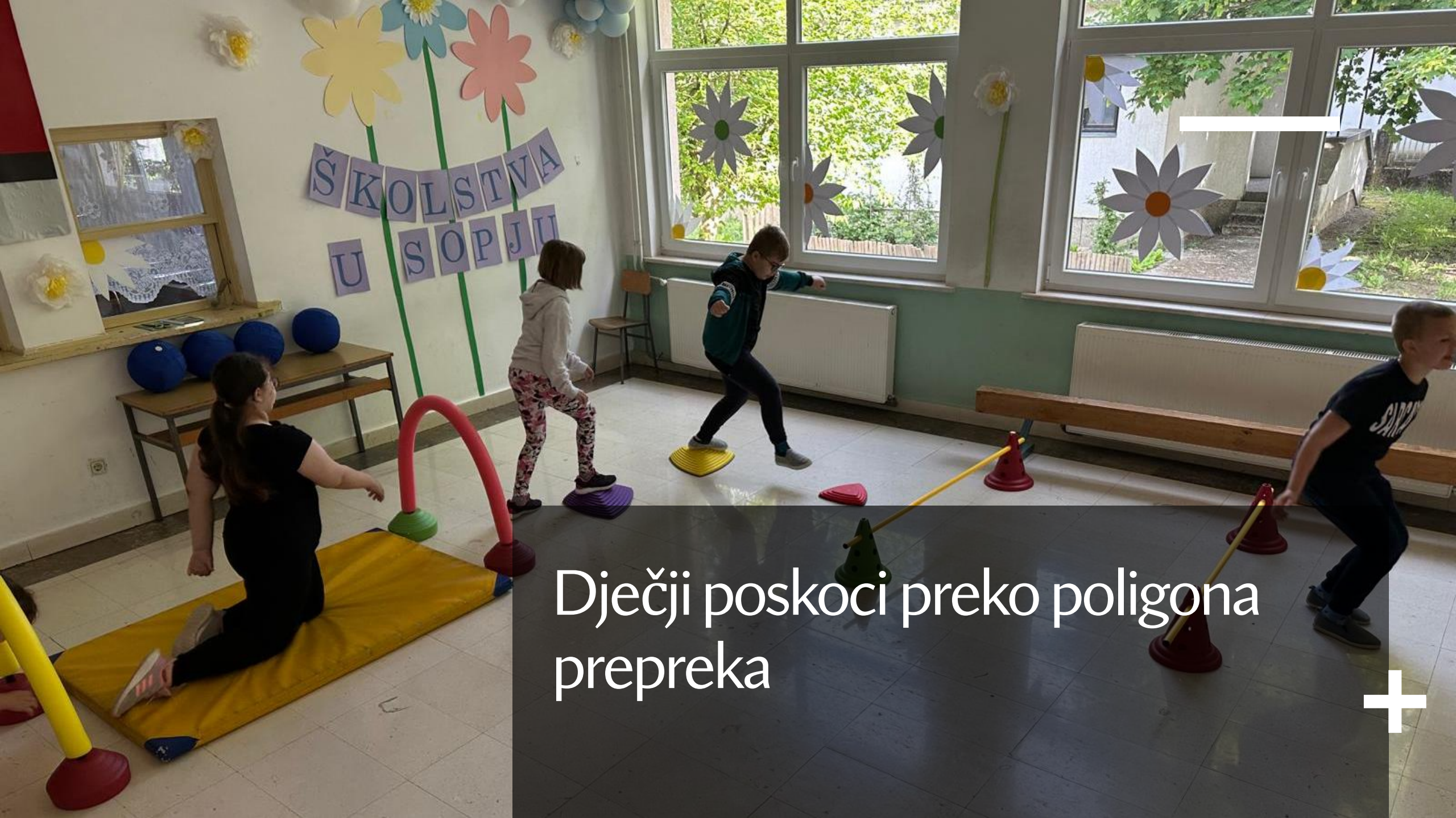
Dječji poskoci preko poligona prepreka