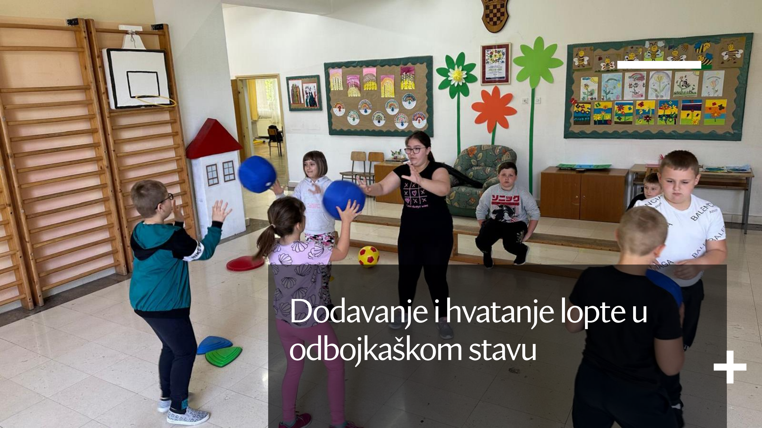
Dodavanje i hvatanje lopte u odbojkaškom stavu